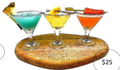
Trio of mini cocktails *no alterations or substitutions allowed The Tempest | Mango Delight Watermelon Martini