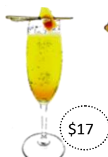
Mango Delight mango, malibu, moscato, soda water