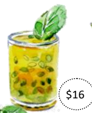
Passionfruit Mojito passionfruit pulp, bacardi, lime, mint, soda water