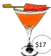
Watermelon Martini vodka, peach liqueur, watermelon, apple juice