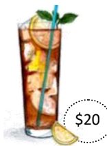
Long Island Ice Tea vodka, rum, tequila, gin, cointreau, cola