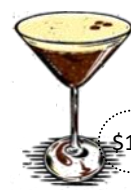
Espresso Martini vodka, kahlua, espresso coffee