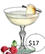
Lychee Martini lychee, vodka, lychee juice