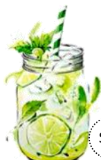
Mojito bacardi, lime, mint, soda water