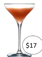
French Martini vodka, chambard, pineapple juice