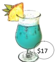
The Tempest malibu, blue curacao, pineapple juice, coconut cream, prosecco