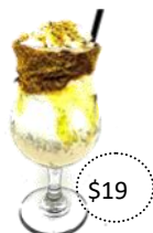
Golden Gaytime baileys, butterscotch schnapps, tia maria, honeycomb, cream,