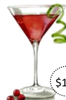
Cosmopolitan vodka, triple sec, lime, cranberry juice