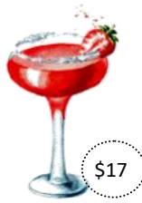
Frozen Daiquiri strawberry or mango bacardi, lime, ice