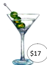
Classic Martini gin, dry vermouth, olives