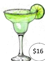
Margarita tequila, cointreau, lime juice