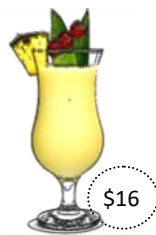
Pina Colada malibu, pineapple juice, coconut cream