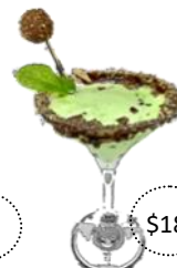
Ferrero Mint crème de menthe, crème de cacao, cream