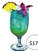
Summer Breeze midori, malibu, blue curacao, banana liqueur, pineapple juice